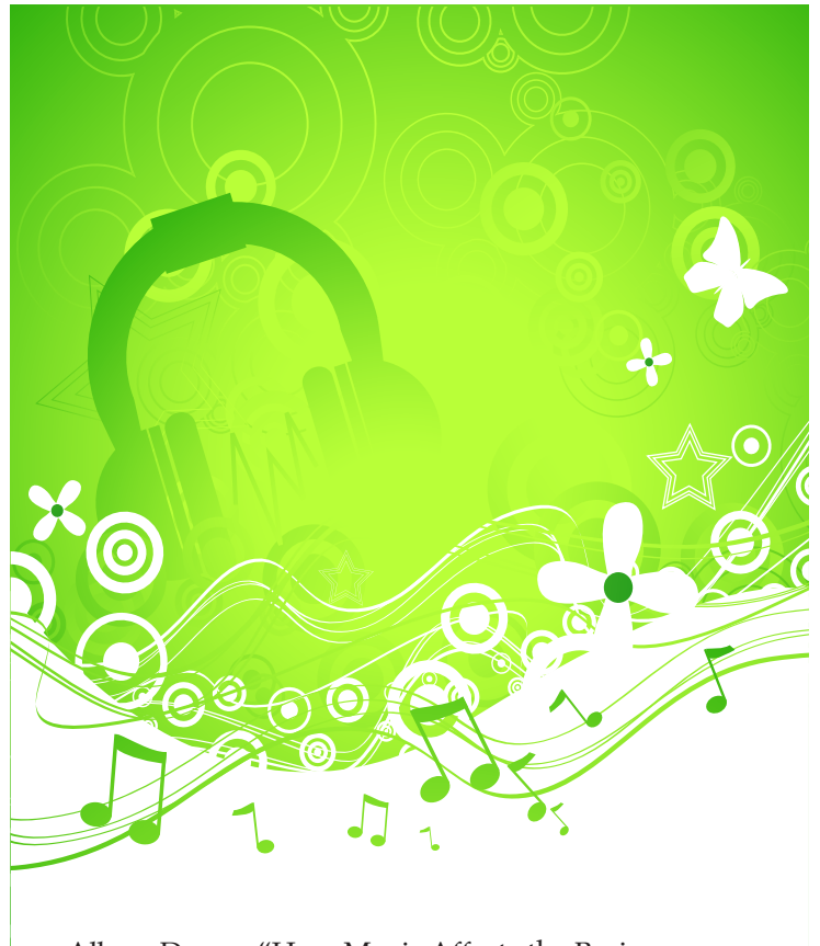
Alban, Deane. "How Music Affects the Brain for the Better" Be Brain Fit: Better Mind. Better life. Be Brain Fit & Blue Sage, LLC, 2012, http://bebrainfit.com/musicaffectsbrain/ . Accessed 16 September, 2016

Students who have had musical training do better in subjects such as reading, language, and math and have better fine motor skills than their nonmusical classmates. Early music lessons help brain plasticity the ability of the brain to change and grow.